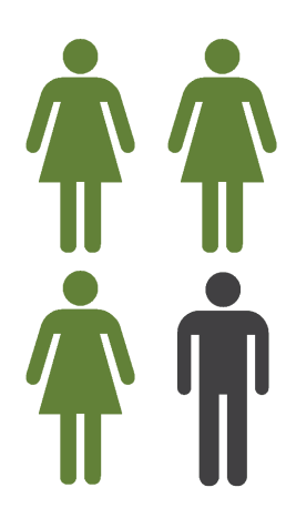
75% women and 25% men